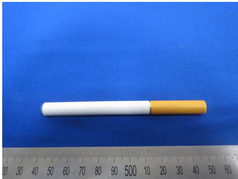
A9-3S( Menthol 16mg)